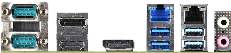
RM-10-CML Rear I/O.